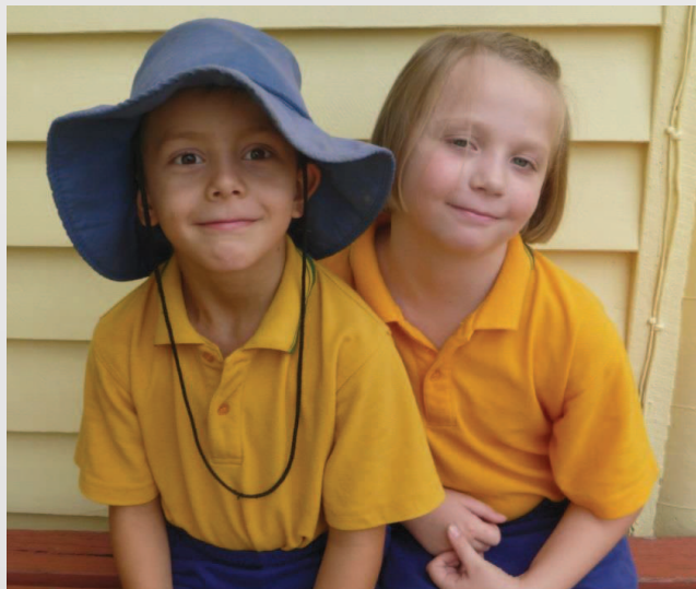
Students of the week